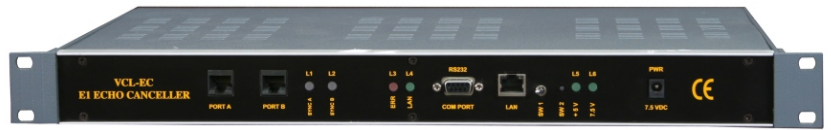
E1 Echo Canceller 1U (44 mm high) 19 inch Version with Telnet

Comarra offers a compact, robust and cost effective E1 Echo Canceller solution in 19 inch, 1U high (44mm height) chassis (accommodates 1, E1 Echo Canceller with telnet, per shelf). Echo cancellation on each channel is 64ms. bidirectional/128ms. unidirectional echo tails - user selectable. T1 Echo Canceller is also offered and available.